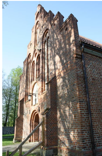
Fig. 1. Holly Mother of Lipsk Sanctuary – entrance

This paper focuses on the results of a research conducted in the village of Lipy situated in the Warmińsko-Mazurskie province of Poland. The village was named after a lime tree that grew there in the 13th century, under which the Prussian community inhabiting the area prayed to the goddess Majuma. According to a local legend, once, when the local people were saying their pagan prayers, the Holly Mother appeared in the tree [8]. To commemorate this miraculous event, a wooden church was built. It was later destroyed and in 1626 it was replaced by a brick building. In 1861, the church burnt down. In 1870, a new church was built in the neo-Gothic style, which survived to our times (Fig. 1). Gradually, more and more houses were built around the church to finally form a village. Currently, the church is known as the Holly Mother of Lipy Sanctuary, and is popular among pilgrims from all over the country [9]. The village is currently inhabited by people who have nothing to do with farming. Most of them work in industrial plants in the nearby town of Lubawa. Nevertheless, the village has retained its idyllic climate.